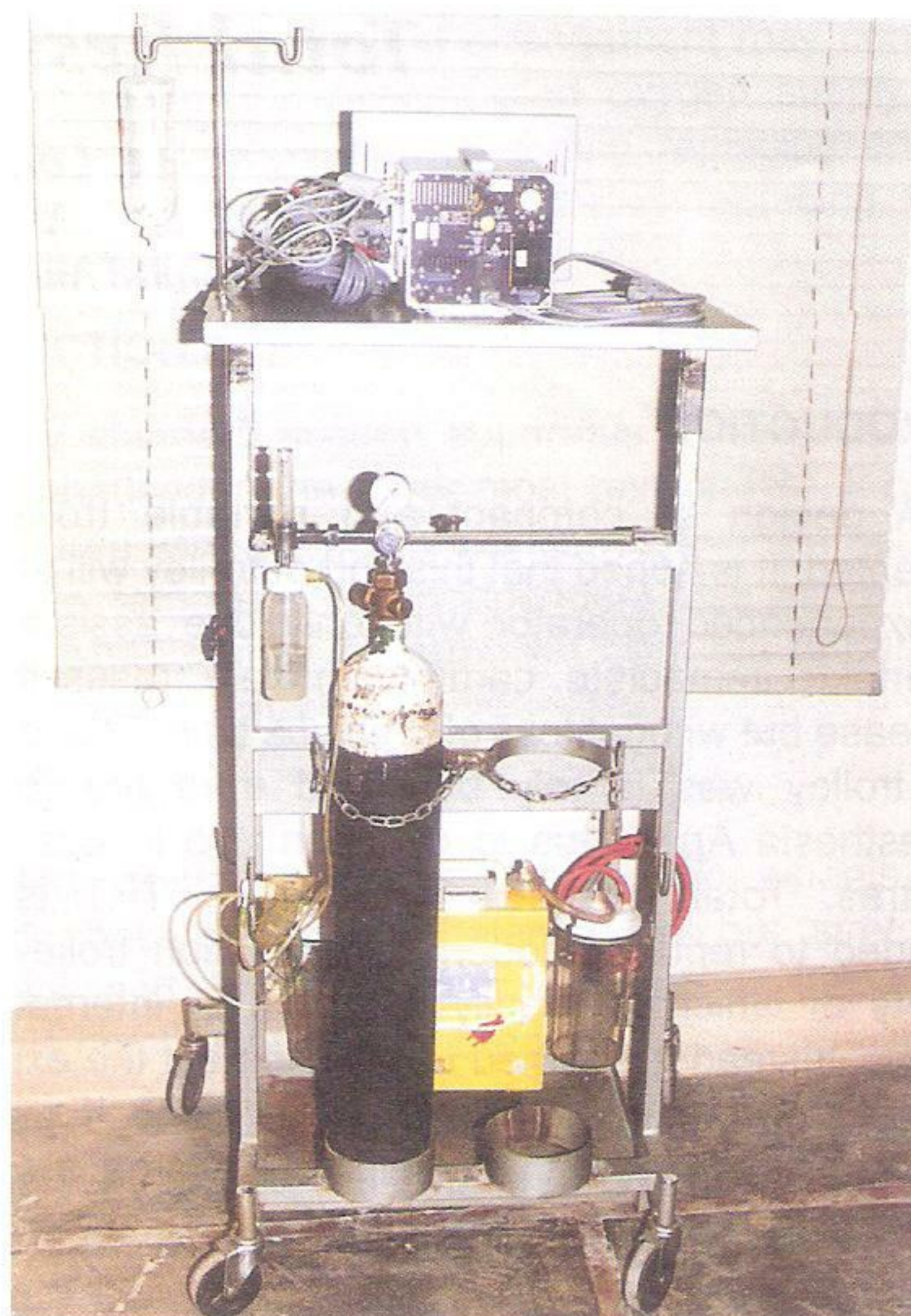
Back view of TRT showing O 2 cylinder