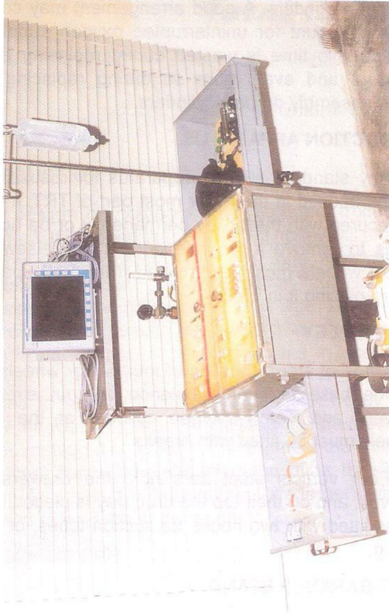
TRT with opened drawers