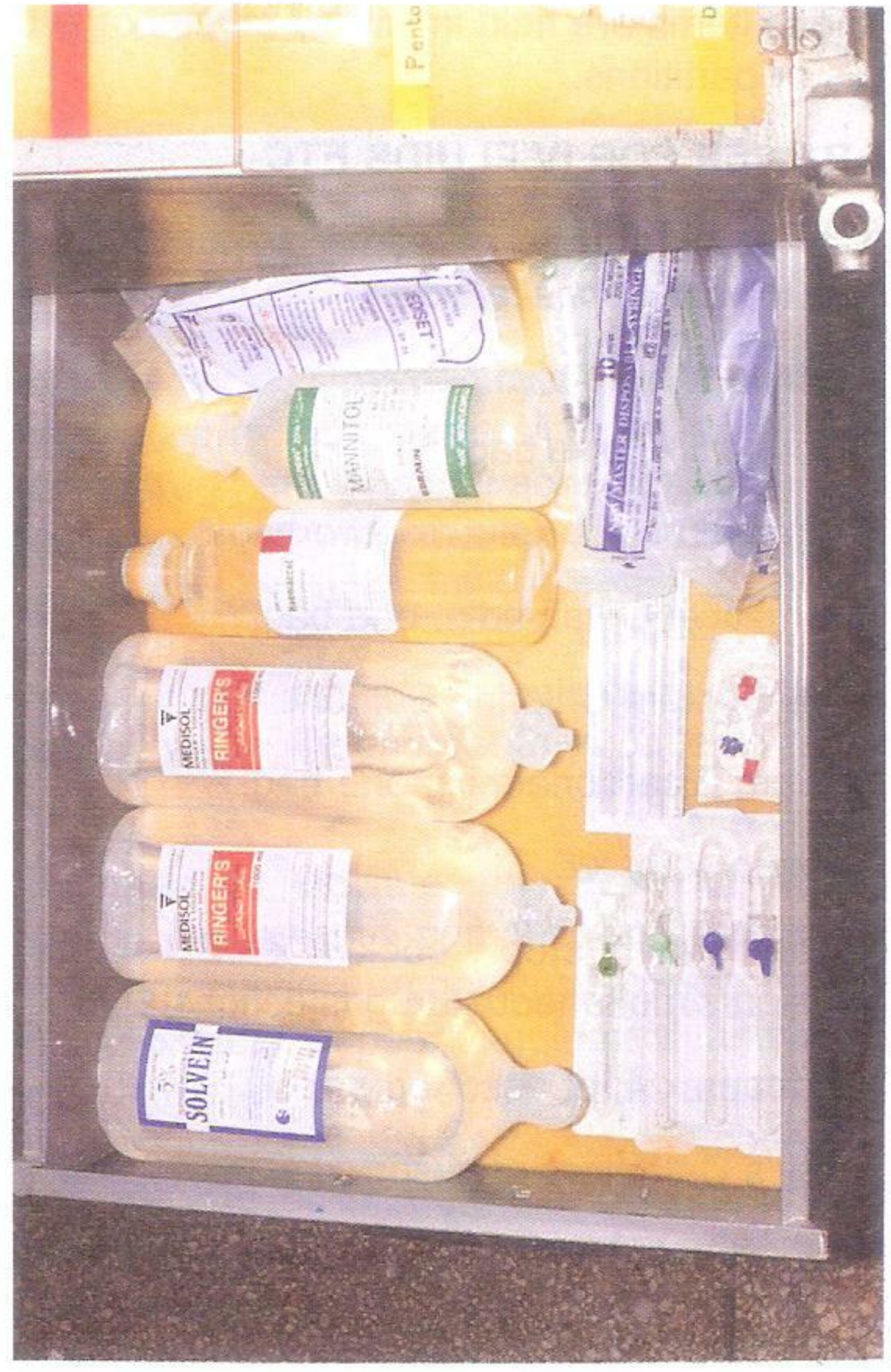
Drawer for IV infusions/Cannulae etc