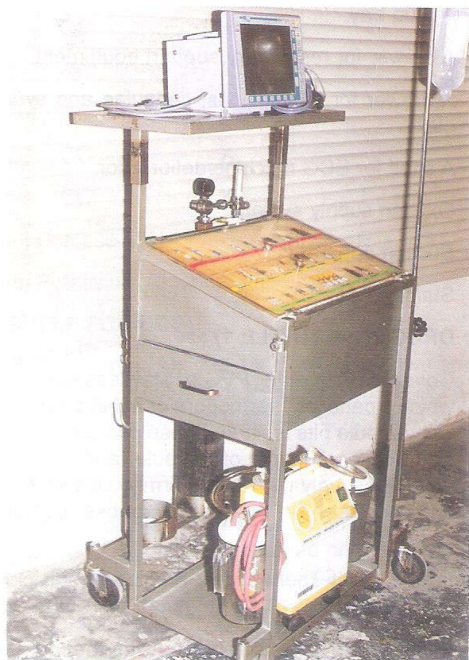
Anterolateral view of TRT