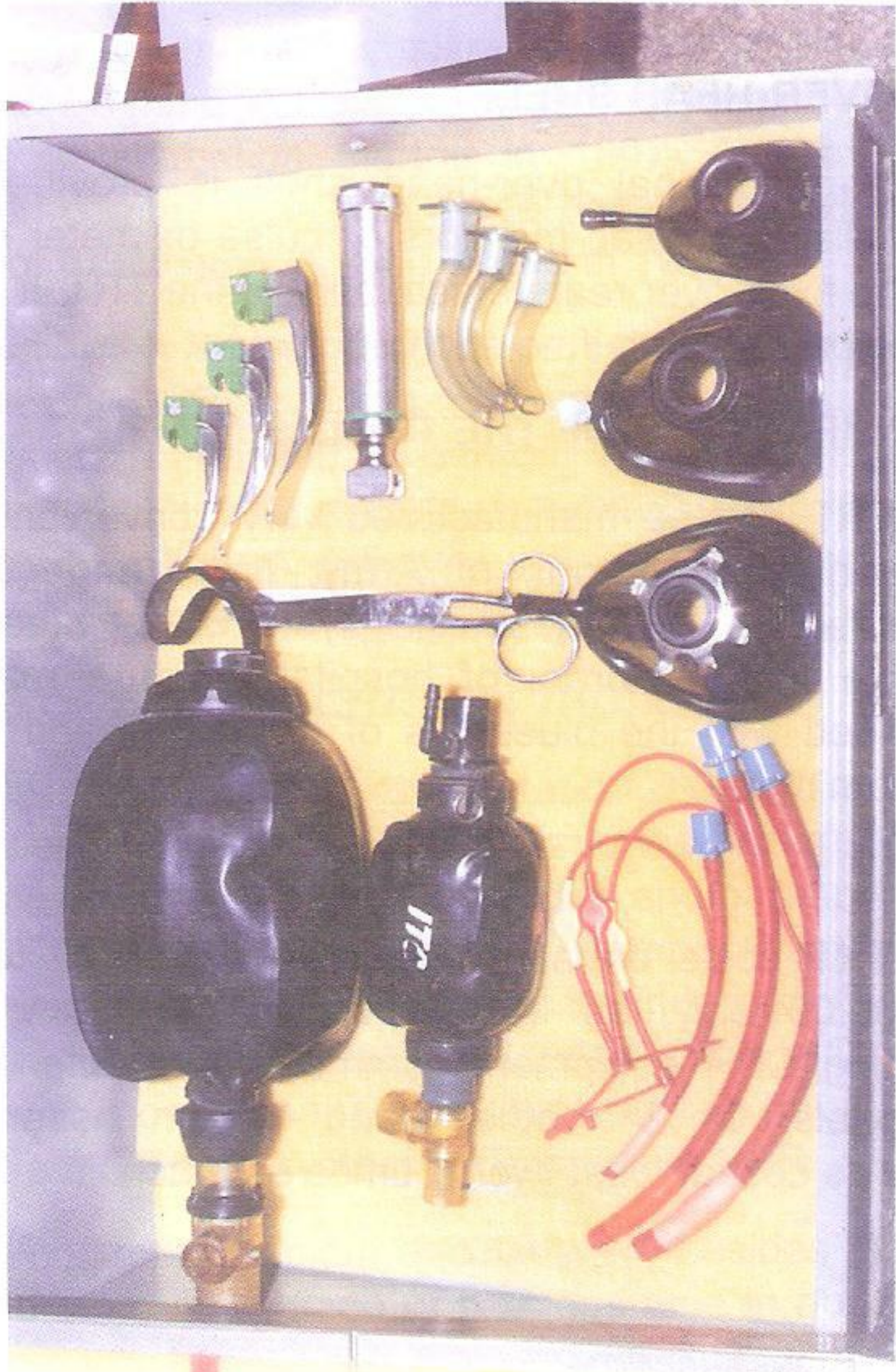
A drawer for resp. Support eqpt