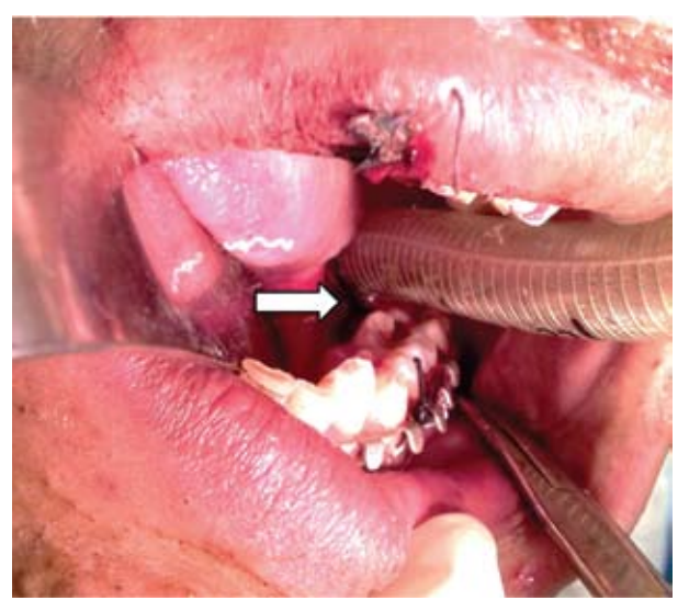
Figure 3: Arrow showing intraoral fixation of ET tube at molar teeth using silk suture

Taking all aseptic precaution of the skin of the neck, lower face and end of the tube, a 1.5 cm skin incision is made in submental region, just medial to the lower border of mandible, approximately one third of the way from symphysis to the angle of mandible. By keeping the mouth open a medium size artery forceps is introduced through submental incision, keeping the