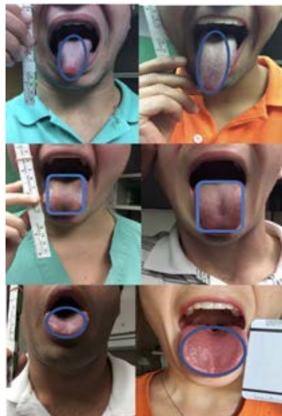
Figure 2: b) The variability in tongue shape between the clinical research team members is depicted.