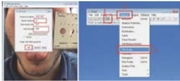
Figure 1: a) Method to calibrate the scale prior to analysis