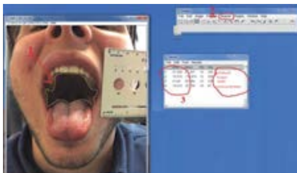
Figure 1: c) Method to calculate the necessary oral cavity structures.

oral cavity, percent area of tongue, teeth, teeth and tongue, and unoccupied area) to determine intra-rater reliability. Then, the standard deviations and variances were calculated for the mean values of each measurement of one photo between 7 different raters to determine inter-rater reliability. The means, standard deviations (SD), and variances were found using Microsoft Excel®.