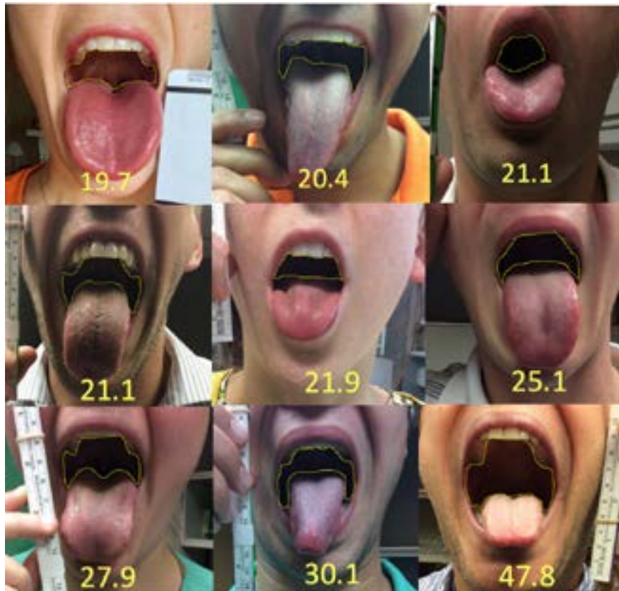
Figure 3: Each number represents the ratio of the unoccupied area in the oral cavity and is paired with its respective image to display the spectrum of ratios that were found. The yellow lines represent the area that is considered to be unoccupied area, which was used in our calculation of the ratio.

We found that there was a large variability in the digital imaging analysis of the sizes and shapes of tongues. We found that the size of the tongue was only important if given in relation to the rest of the oral cavity. Therefore, we calculated the ratio of the unoccupied area to the entire oral cavity, with small numbers meaning the tongue takes up a large proportion of the oral cavity leaving little unoccupied area to maneuver an airway device for intubation. Using our digital imaging technique with ImageJ software, our study obtained high intra- and inter-rater reliability.