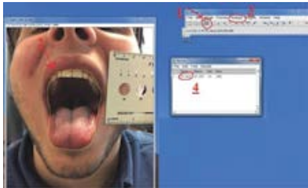
Figure 1: b) Method to measure areas in ImageJ