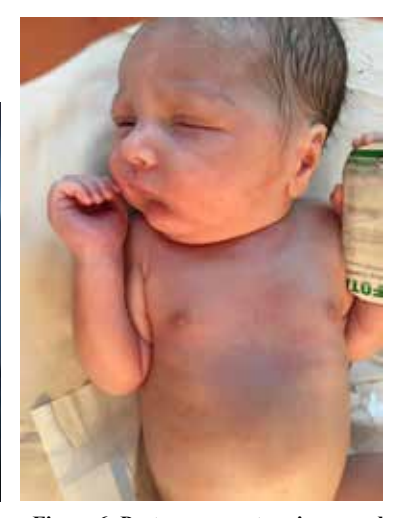
Figure 6: Pectum excavatum improved after inflation of the lun