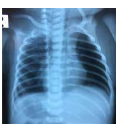
Figure 4: Pectum excavatum improved after inflation of the lung