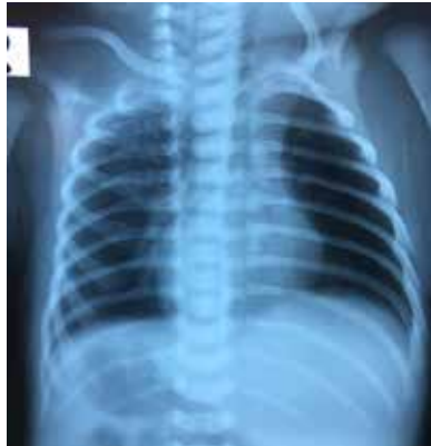
Figure 5: Incomplete inflation of the right