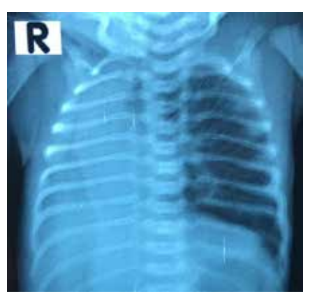
Figure 2: Collapsed Rt lung