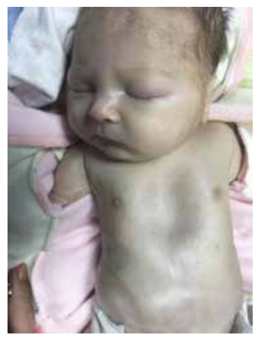
Figure 1: Gross pectum excavatum

Baby was delivered via spontaneous vaginal delivery after 35 weeks gestation in a peripheral hospital. Apgar score 1 was zero. Resuscitation done for 10 min successfully, was intubated and ventilated. Chest x-ray and CT scan chest showed Rt lung collapse. Chest showed severe retraction, and the neonate developed pectum excavatum over 10 days. There was a suspicion of pulmonary agenesis and pulmonary angiography was suggested. In our hospital deep suction of the tracheobronchial tree was done, and a large meconium plug was removed. The right lung inflated successfully and condition of the baby improved.