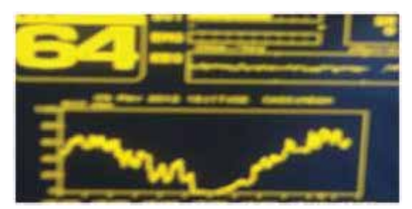
Figure 3: Processed EEG index value sudden drop to zero (white arrow).