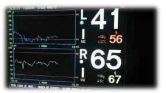
Figure 1: INVOS<sup>®</sup> monitor showing asymmetry in the values and a fall of 27% from the baseline value in the left hemisphere.