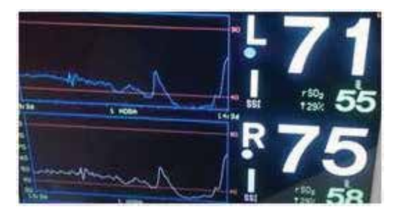
Figure 4: CNIO (Cerebral rSO2) showing low values bilaterally, with significant drop from baseline (white arrows)

is closely related to SvO<sub>2</sub>. Cerebral non-invasive oximetry (CNIO) by NIRS, offers the possibility to non-invasively determine the cerebral oxygen balance and might reflect not only regional but also the systemic oxygen balance.<sup>6</sup> Decreases in rSO_2 > 20 % from baseline have been associated with cerebral ischemia and increased peri-operative morbidity. Processed electroencephalography and bispectral index (BIS) analysis measure electrical activity in the brain and possibly correlate with the oxygen supply and demand balance.<sup>7</sup>