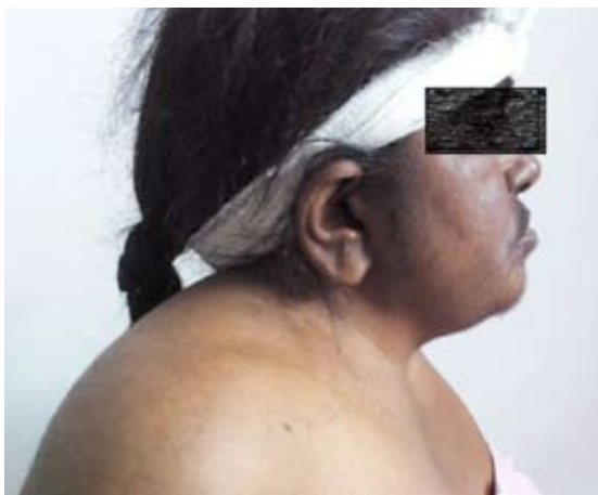
Figure 1: KFS features including short neck with low lying posterior hair line