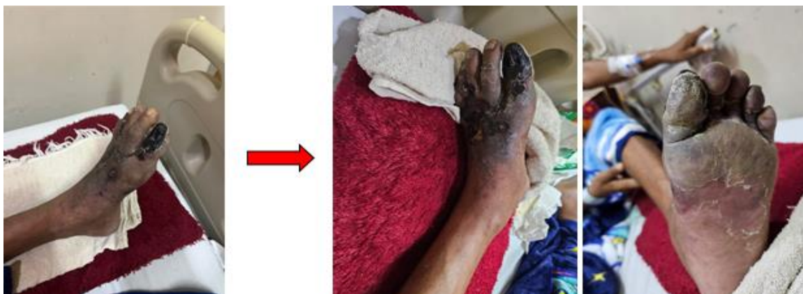
Figure 2: Changes in foot 12 hours after CPSB discontinuation