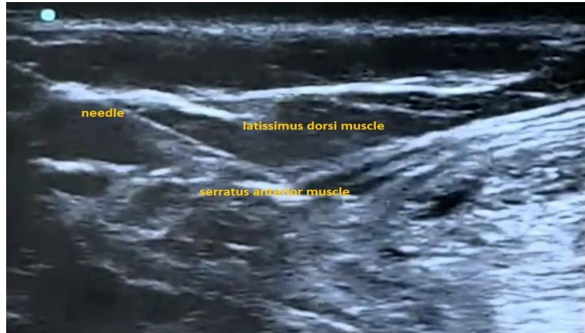
Figure 1: ultrasonography image of a needle positioned between serratus anterior and latissimus dorsi muscles.

On arrival of the cases to the operating room a 20-gauge iv access was inserted at the contralateral side of the surgery. Heart rate, non-invasive blood pressure, ECG and pulse oximetry (SpO 2 ) were monitored during the perioperative period. Induction of general anesthesia was performed using propofol 2 mg/kg IV, fentanyl 1 µg/kg IV and atracurium 0.5 mg/kg IV. After surgery, the patient was placed on his side, with the surgical side facing up and the arm abducted. SonoSite™, Inc., Bothell, WA 98021, USA, provided the linear US transducer (6–13 MHz). The fifth rib level was the location of the probe in the transverse plane of the midaxillary line. There was a visual representation of the ribs, pleural line, and latissimus dorsi and serratus anterior muscles above it. After applying 3 ml of 2% lidocaine