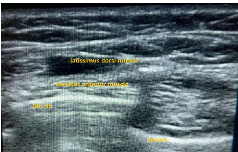
Figure 2: An ultrasound image of the area between serratus anterior and latissimus dorsi, displaying the pleura and fifth rib.

At 0, 1, 2, 6, 12, and 24 h following surgery, the heart rate, mean arterial pressure, and NPS score were noted. Intravenous boluses of 5 mg of nalbuphine were