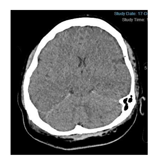
Figure 2: Computed Tomography (CT) Brain

Filling defects in the posterior segmental branch of both lower lobe pulmonary artery in keeping with pulmonary embolism. Bilateral pleural effusion with adjacent consolidations.