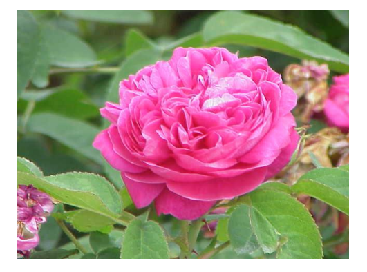
Figure 1: Rosa Damascena flower

This flower is used in perfumes, in medicine and for flavoring in the food industry. <sup>14</sup> The scent of the rose with two elements, citronellol and phenethyl, is effective on the central nervous system, and as a result, it causes a hypnotic and relaxing effect. Rose is one of the most widely used medicinal plants recommended for the treatment of sleep disorders. <sup>15</sup> However, based on our search, the effect of the smell of rose on the sleep status of premature babies has not been investigated. Since the access to rose water is easy and inexpensive, this study was conducted to find the effect of aromatherapy with rose water on the deep sleep status of premature babies hospitalized in the NICU.