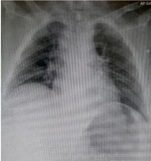
Figure 1: Chest X-ray shows increased bronchovascular markings and opacities in the lung fields.

The treatment of AKI is renal replacement therapy (RRT), with either continuous RRT, hemodialysis (HD), or peritoneal dialysis (PD), with the latter being an option for kidney failure. The geographic location, socio-economic conditions, and clinical manifestations of the patient appear to affect the selection of the modality. 5 PD is sometimes the primary dialysis choice in low- to middle-income countries. It can remove waste products from the body using dialysate and the peritoneum as a filter for this process. 4 This case report highlights the use of PD as a treatment modality for sepsis-associated acute kidney injury (S-AKI) in an adolescent with multi-organ failure. The objective is to remind the physicians treating sepsis-induced renal failure about the usefulness of PD when other options are restricted or non-available.