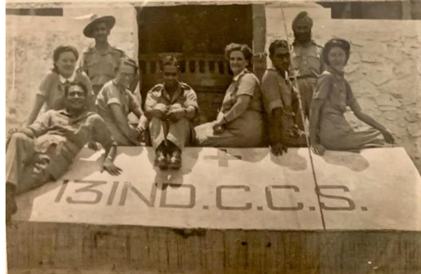
Figure 6: At 13 Indian Casualty Clearing Station