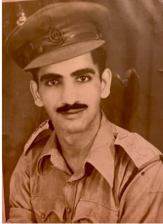
Figure 5: As a young captain

He returned to join KEMC as assistant professor and Mayo Hospital Lahore as the Chief Anesthetist in 1953. He taught at both KEMC and Fatima Jinnah Medical College (FJMC) Lahore, and trained many postgraduates in the latest techniques of anesthesia at that time.