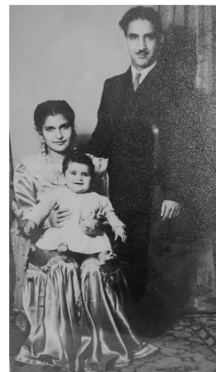
Figure 3: Early family life