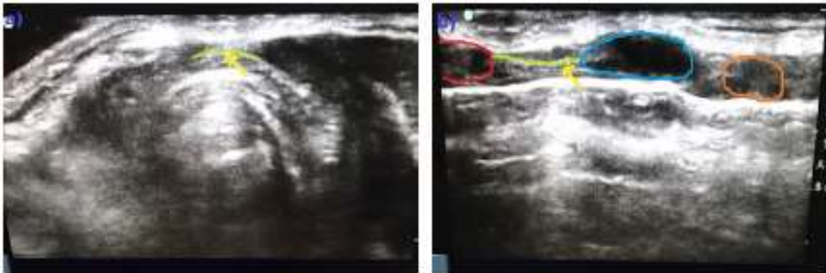
Figure 1(a): Transverse view of ultrasound showing the arch-like appearance of CTM (green line with arrow), (b) The sagittal view showing the thyroid cartilage (red), cricoid cartilage (blue), tracheal ring (orange) and CTM (green line with arrow).