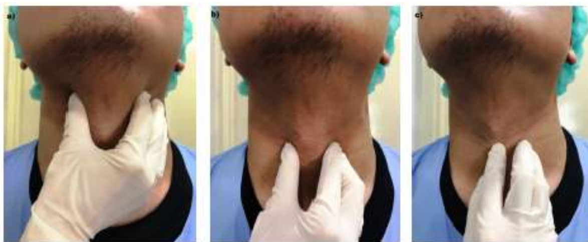
Figure 4: The laryngeal handshake. (a) The thumb and index finger grasp the greater cornu of the hyoid bone (top of the larynx) and roll it from side to side. (b) The fingers and thumb slide down over thyroid laminae. (c) Middle finger and thumb rest on the cricoid cartilage with the index finger palpating for cricothyroid membrane

taken as the mid-point of CTM. An accuracy box was then defined as 0.5 cm from mid-point, vertically and horizontally (Figure 2).