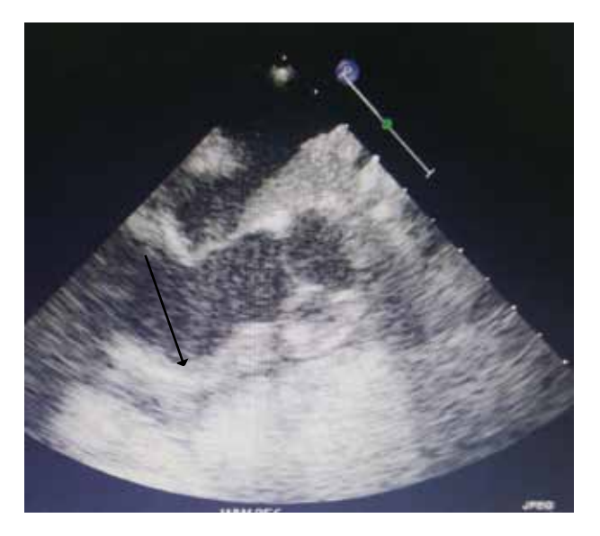
Figure 1: The transesophageal echocardiographic image demonstrating the presence of newly formed clot in the LV cavity. LA cavity also showing the presence of clot

intracranial hypertension in internal jugular vein stenosis